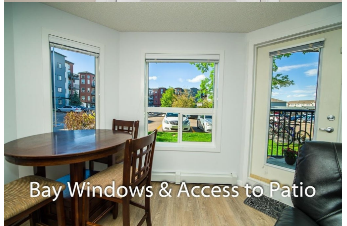
Bay Windows & Access to Patio